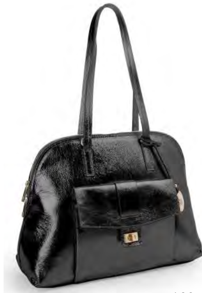
Style #B278 (14"x 5"x 11"H) $89. Lam. Suede Leather: Silver, Black (RTW)