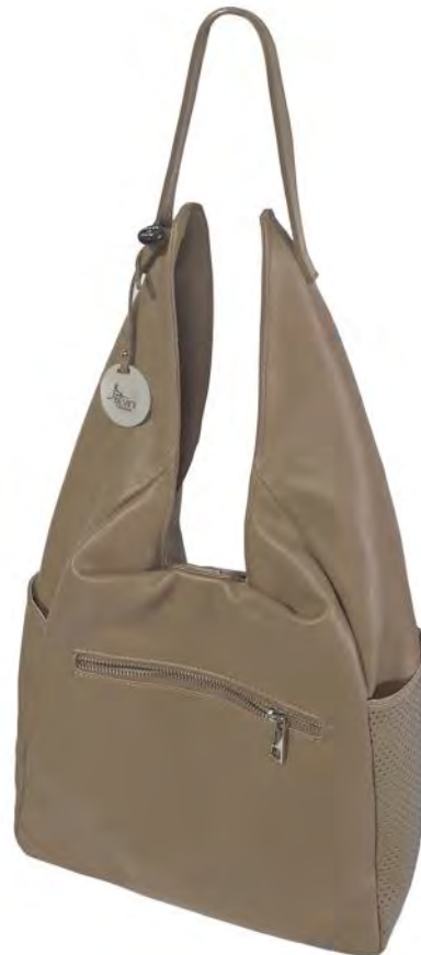
Style #LUCREZIA Large Hobo (12"x 7"x 20"H)