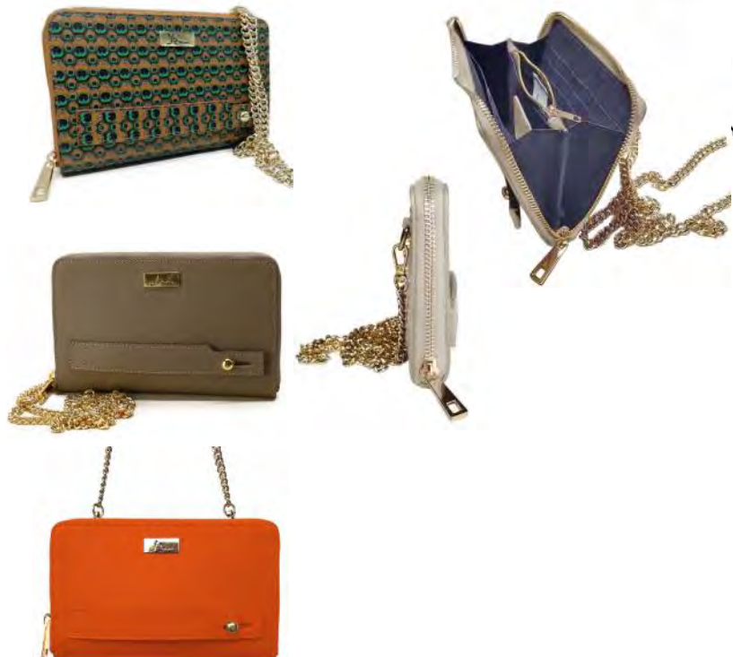
Style #AFTER5 - CrossBody (8"x 1"x 4 1/2"H)