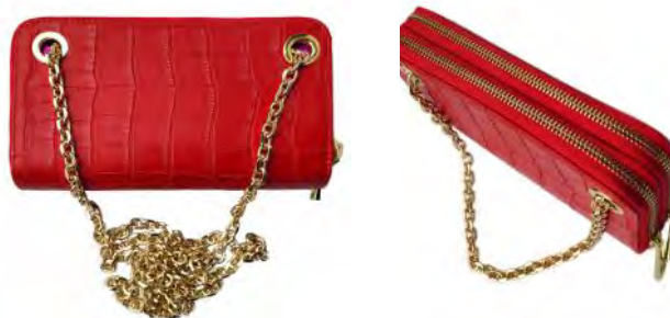
Style #W08-AFG Dual Wallet/CrossBody with chain (8"x 2"x 4 1/2"H) $72.

Crock stamped Leather w/chain strap: Red w/Gold Hardware,