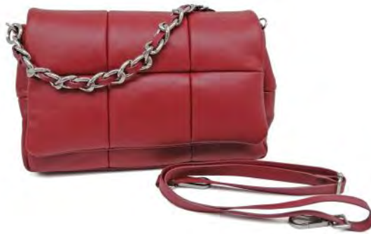
Style #B444 THEA (12"x4"x8"H) $135. Padded Sauvage : Red, (ETA 3 Weeks)