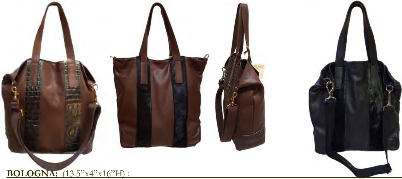
BOLOGNA: (13.5"x4"x16"H) : Sauvage Leather with Haircalf +Croc trim : Brown, Black