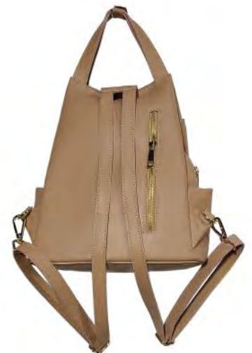
Style #B334 - Backpack (10.25"x 4.5"x 11"H)