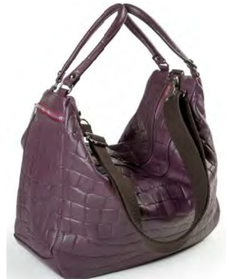
Style # LAMPEDUSA (15.5"x 6.5"x 11"H) Crock Dollaro Leather: Navy, Yellow (RTW)