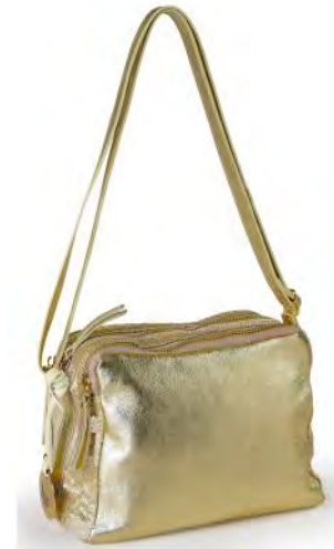
Style #B237 (9"x 4"x 7"H) $79. Lam. Suede Leather: Silver, Gold (RTW)