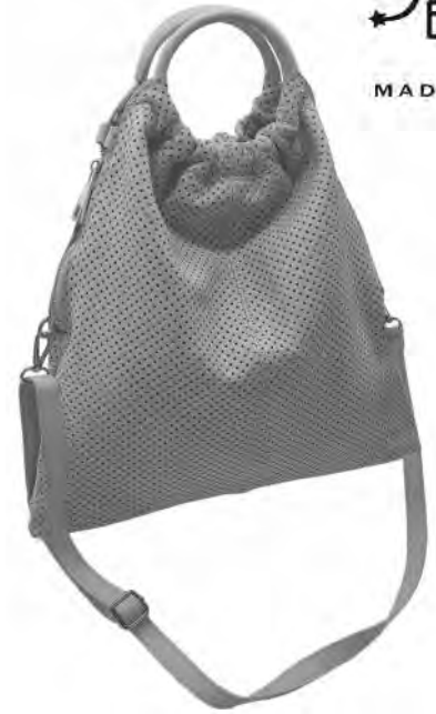
Style CLEOPATRA #B323 (9"x 5"x 10.5"H)