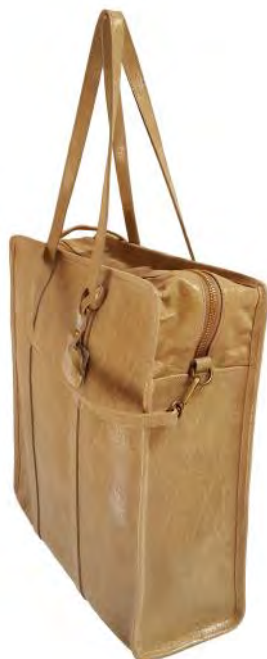
Style #JS13 (14"x5"x14"H) $79. Crinkled Suede Leather: Beige RTW