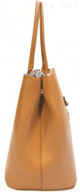
Style #B235 (15"x 7"x 10.5"H) $89. Ruga Structural Leather : TAN (RTW)