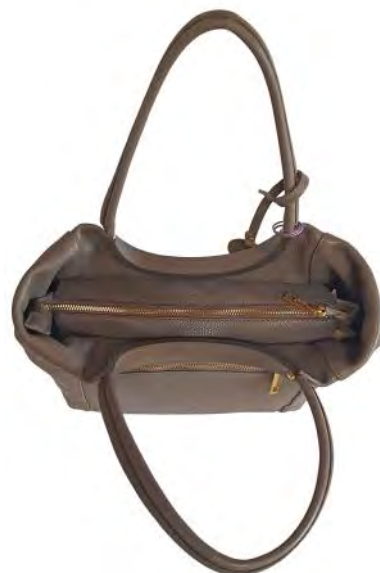
Style #B275 Dollaro (12"x 5"x 12"H) $89. Dollaro Leather: Taupe (RTW)