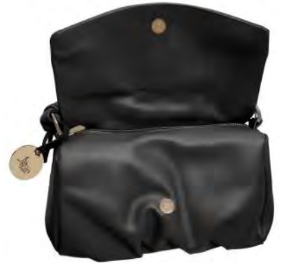
Style #B450-THE CALI (12"x 4"x 7"H) Sauvage Leather:: Olive, Black,