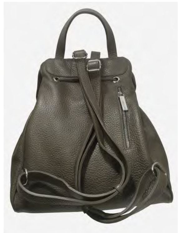
ALBA Large Backpack (16"x8"x18"H)