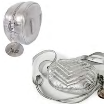
Style #B232 Fanny Pack + Belt (8"x 2"x 5.5"H) $79. Laminated Suede : Silver (RTW)