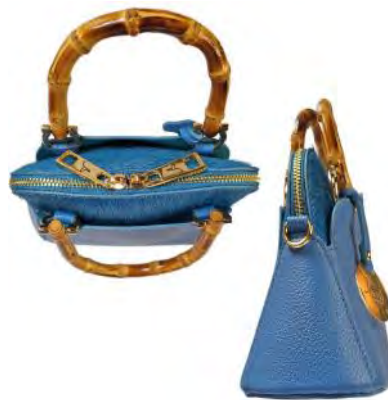
Style #B140 Bamboo (9"x 5"x 10.5"H) $79. Dollaro Leather with Haircalf trim + Adj. shoulder strap: French Blue (RTW)