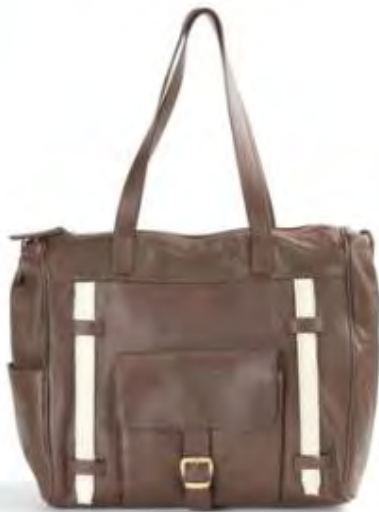
FIRENZE -Postman Bag: (13"x6"x11"H) Sauvage Leather with Haircalf trim $160. (RTW)