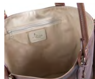
Style #B196 Large (13.3"x4.7x14"H) $89. Dollaro Leather : Tan RTW