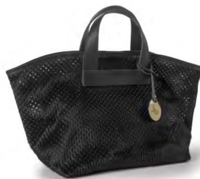
Style #Q10 HAIRCALF (11"x 6"x 9"H) $89. Perforated Haircalf: Bordeaux, Black (RTW)