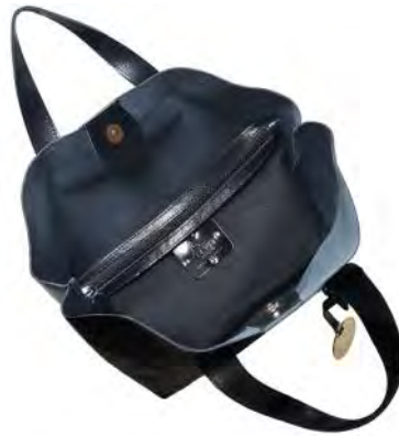
Style #Q10 (11"x 6"x 9"H) Saffiano Leather: Black