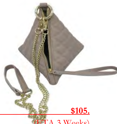
Style #B479 (8"x8"x8"H) $105. Quilted Sauvage : Beige, Cielo, Blush (ETA 3 Weeks)