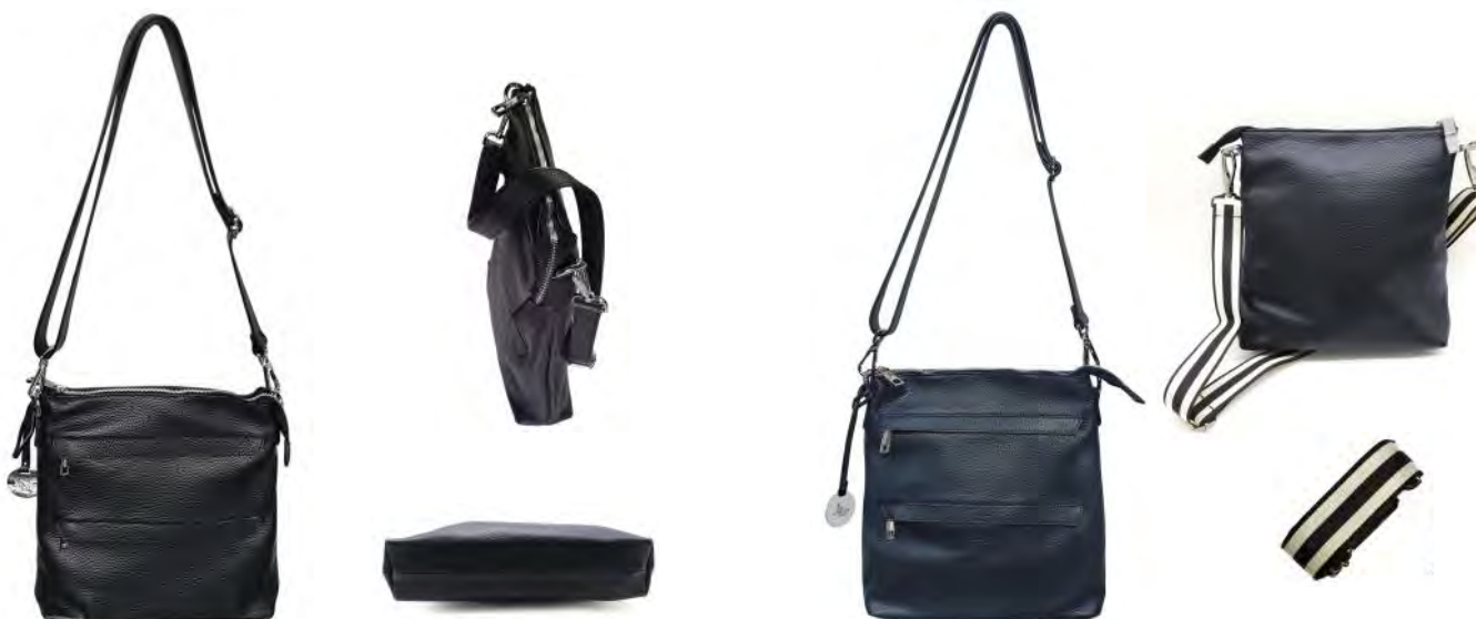
Style #VENEZIA -LIDO CrossBody w/1" wide leather strap (11"x 2"x 12"H)