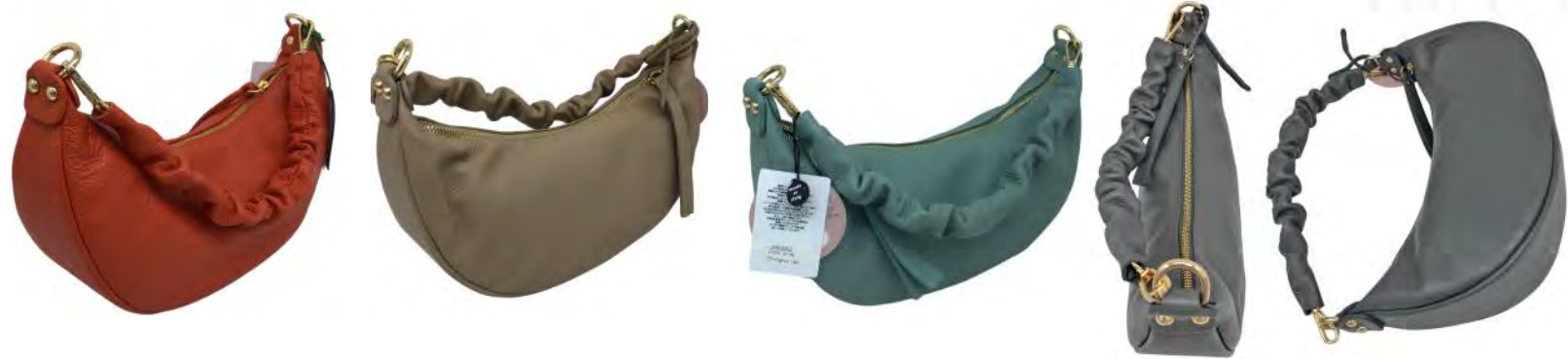
Style #B502 VALERIA (12"x 4"x 5.75"H) Dollaro Leather: Orange, Taupe, Grey, Seafoam Green