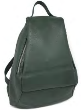
Style #B489 Backpack (13"x 5.5"x 15"H)