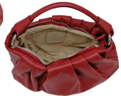
Style #B459 (12"x 4"x 7"H) Sauvage Leather: Light Taupe, Red