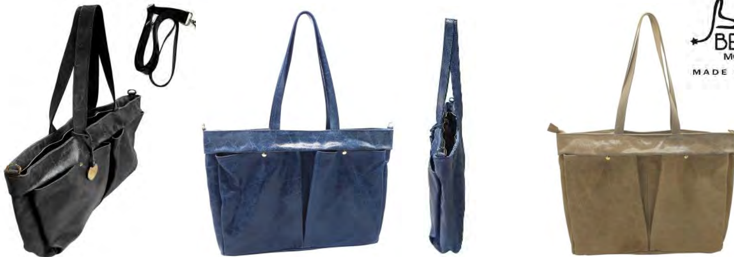
Style #TIZIANA (18"x 3"x 14"H)