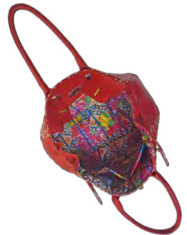
Style #WA01 - Dollaro (13.7"x7"x9"H) Vintage Denim, Ivory+ Rafia, Red+Rafia, Bordeaux+Rafia