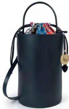
Style #B204 (8"x 8"x 11"H) $79. Ruga smooth Leather: Navy (RTW)