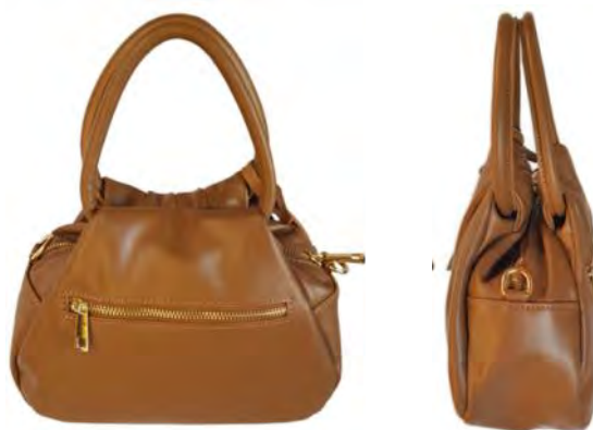
Style #B358 (10"x5"x7"H) $89. Sauvage Leather: Nougat RTW