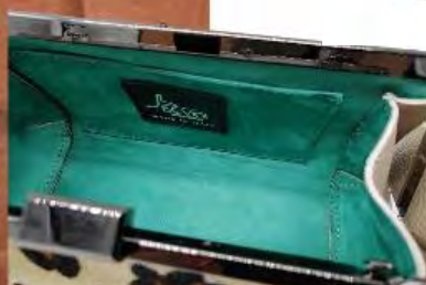
Style #B375 HAIRCALF (8.75"x4.5"x5"H) $79. Leopard Print: Taupe (RTW)