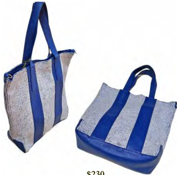
BOLOGNA: (13.5"x4"x16"H) : Alaska Crinkled Leather with Sauvage trim : Grey/Brown, Grey/Bluette