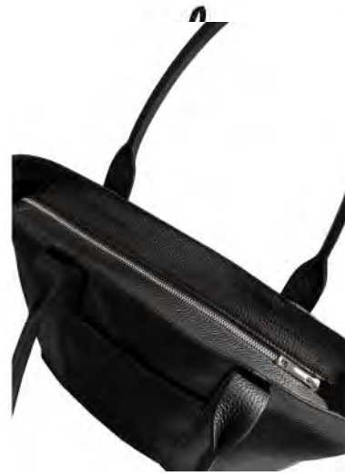
Style #B294 Tote w/double large pockets and adj. Canvas Strap (13"x 4"x 14"H)