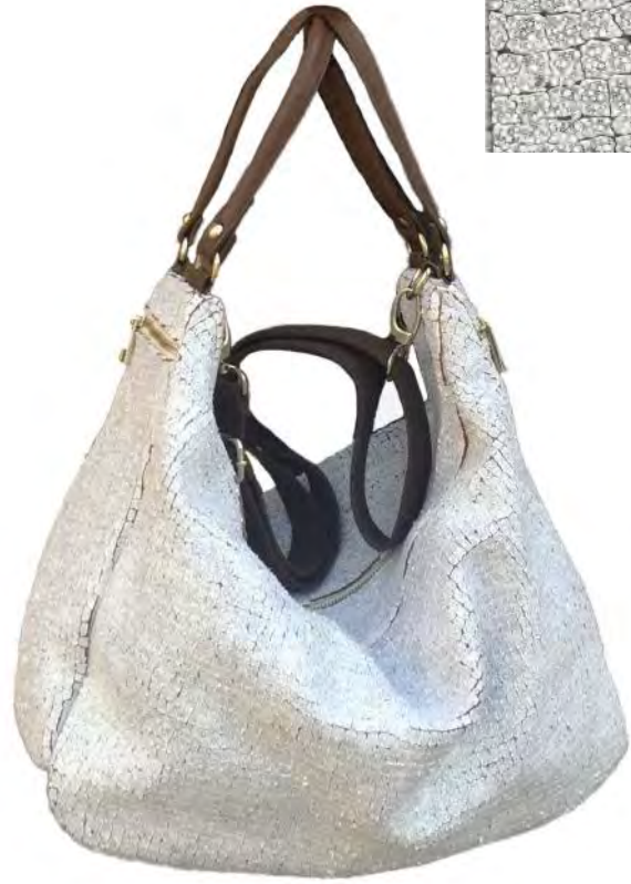
LAMPEDUSA (15.5"x 6.5"x 11"H) Alaska Crinkled Leather with Brown trims