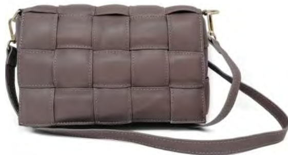
Style #B486-Woven X-Body/Clutch (10"x 2"x 6"H)