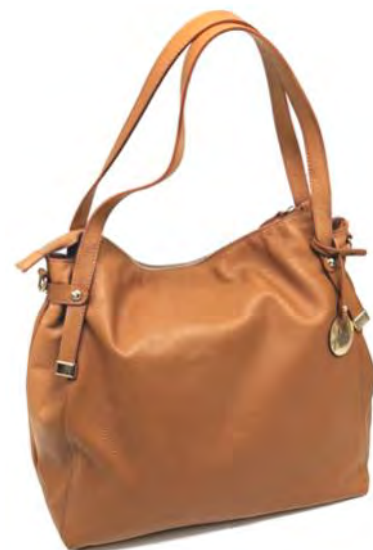
Style #B441 (14"x 6"x 13"H) $135. Dollaro Leather: Black, Taupe, Tan (RTW)