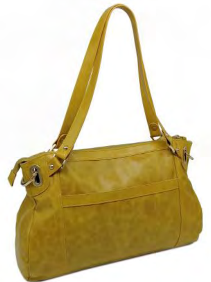
Style NEW RAMONA #RA122 (18"x 3"x 14"H) Crinkled Leather with Adj. strap, fully lined inside: Black, Navy, Yellow