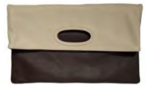
Forte Dei Marmi Dual color Dollaro Leather, foldable clutch. (17"x 3/4"x 17"H) $110.

Black&Red, Grey&Navy, Gray&Green Taupe&DustyBlue, Black&Brown, Panna&Brown, Panna&Black