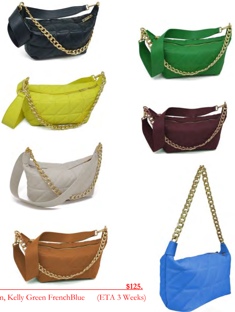
Style #B469M (8.25"x4"x7.75"H) Quilted Savage : Lilac, Black, Lemn, Cream, Tan, Kelly Green FrenchBlue