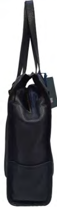
POSITANO: Dual Handles (14"x4.7"x15"H) Dollaro Leather. Black