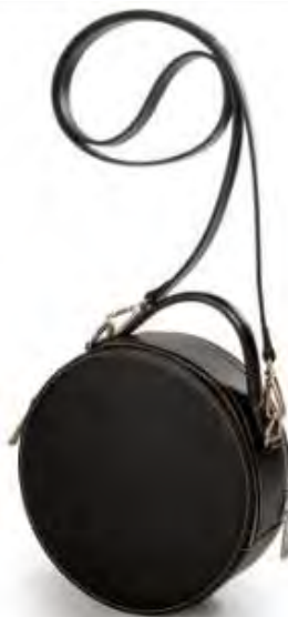
Style #B180 (8" diam x 3" wide) $95.