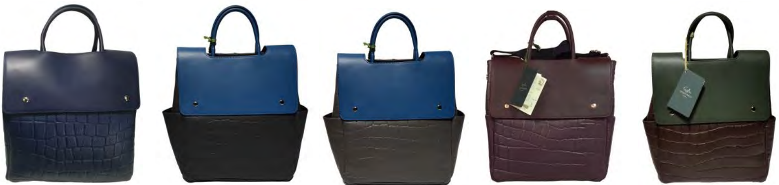
Style #AOSTA Backpack - Shoulder bag (14"x 6"x 14"H) $190. Crock Printed Leather: Navy/Navy trim, Black/Blue, Grey/Blue, Bordeaux/Bordeaux, Brown/Olive (RTW)