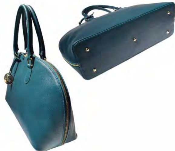
Style #B152 (15"1/2x 5"x 10"H) $79. Palmellato Leather: Taupe, Teal (RTW)