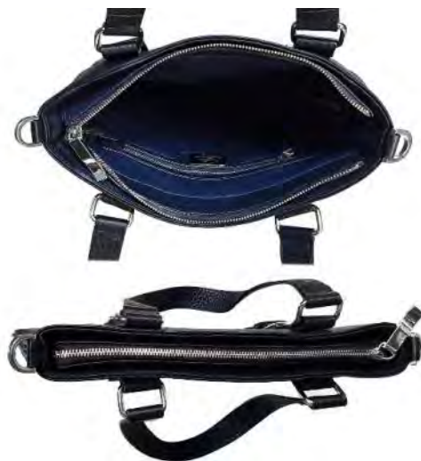
Style # PISA (14"x 1"x 14"H) $220. Dollaro Best Leather:: Navy (RTW)