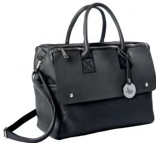
Style #B198 (13"x 6"x 10"H)