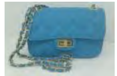
Style #B493 (8"x2.5"x4.5"H) $105. Quilted Sauvage : Lilac, Black, PowderBlue (ETA 3 Weeks)