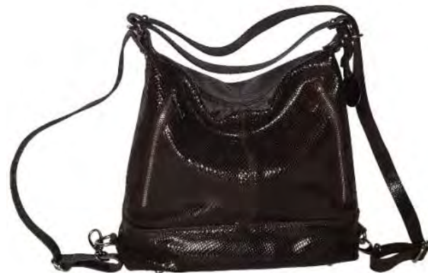
$89. Python print Leather: Brown (RTW)