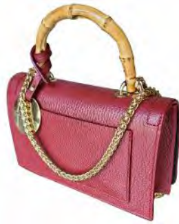
Style #B285 Bamboo (7"x 1.75"x 4.75"H) $79. Dollaro Leather Bordeaux w/Bamboo handle (RTW)