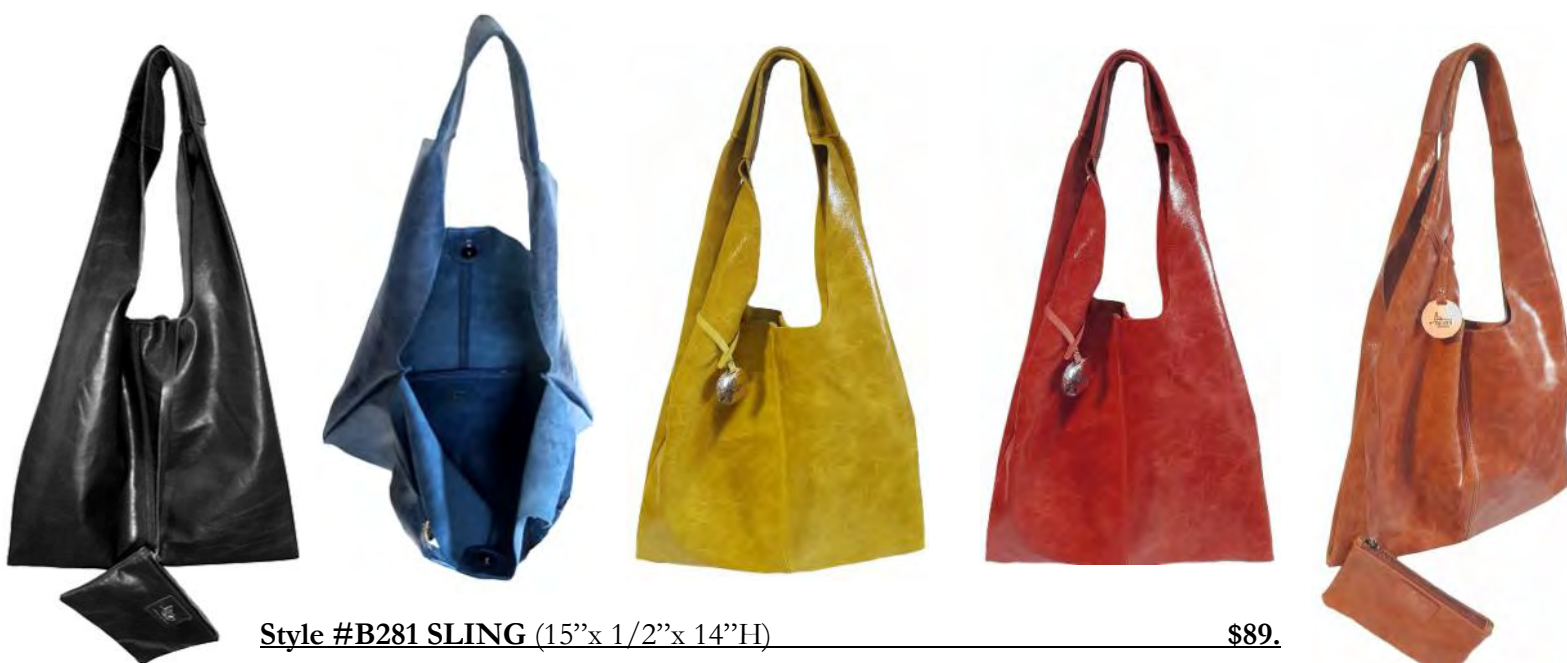
Style #B281 SLING (15"x 1/2"x 14"H)