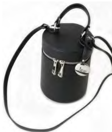
Style #B137 (8"x 8"x 9.5"H) $110. Ruga smooth Leather: Cream, Black (RTW)