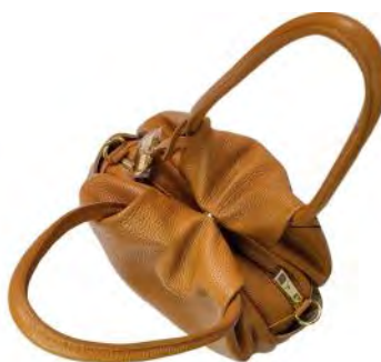
Style #B75P Medium Hobo w/2 side phone pockets (11"x 4.5"x 10"H) $125. Dollaro Leather: Black, Taupe, Tan, DustyBlue (RTW)