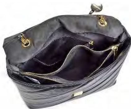
Style #B404 (12"x5.5"x9"H) $130.