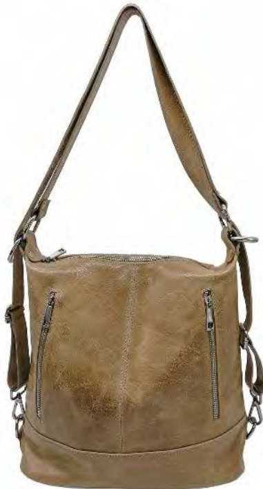
Style #B290 CONVERTIBLE Backpack (13"x6.3"x12"H) Suede Crinkled Leather: Beige, Black