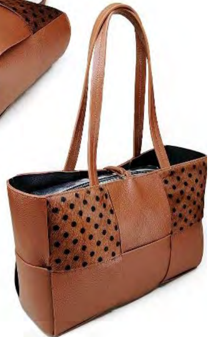
Style #B417 (15"x 5.5"x 10.5"H) $89. Dollaro Leather & Haricalf Pois: Tan (RTW)